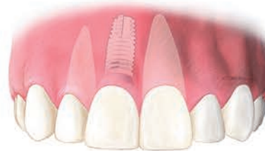
Missing tooth replace with a dental implant and an implant crown.