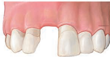
Bone loss in jaw resulting from not replacing missing teeth.