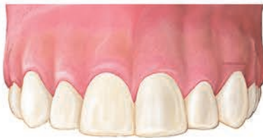
Healthy jaw with no missing teeth.